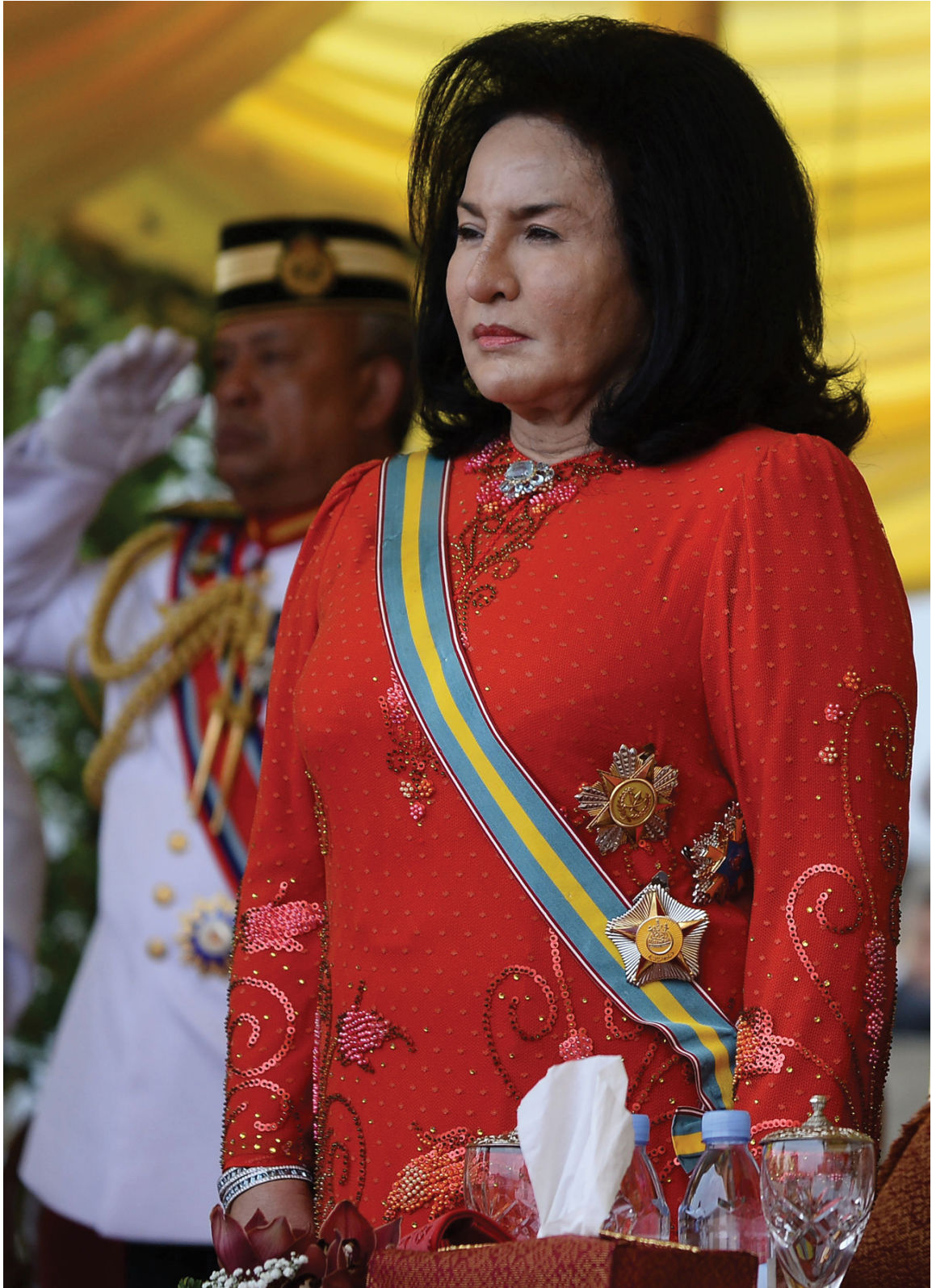
Rosmah Mansor was born to a middle-class family but grew up on the