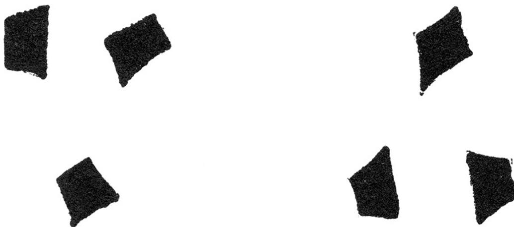
Figure 1. Adapted from Wolfgang Köhler, Gestalt Psychology (1947; repr., New York: Liveright, 1992), 142.

If on a clear night we look up at the sky, some stars are immediately seen as belonging together, and as detached from their environment. The constellation Cassiopeia is an example, the Dipper is another. For ages people have seen the same groups as units, and at the present time children need no instruction in order to perceive the same units. Similarly, in figure 1 the reader has before him two groups of patches.